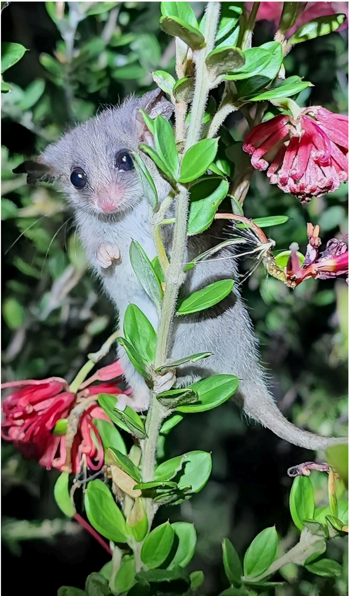
Eastern Pygmy Possum Spotted in the Bays!